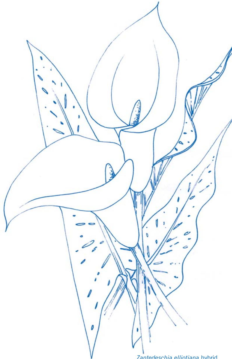
Zantedeschia elliotiana hybrid commonly called "Calla Lily"

The hardiest variety, able to over winter in the garden, withstanding temperatures as low as -5C (23°F). In exceptionally mild areas or in a sheltered town garden, they will often remain evergreen. Bright, glossy green leaves reach up to 40cm (16") long. A dazzling succession of large, pure white spathes appear throughout the summer. Height and spread; 90cm x 60cm (36" x 24"). Z. aethiopica has given rise to a number of exceptional offspring: 'Crowborough' - even hardier than its parent, 'Green Goddess' - green splashed spathes and 'Little Gem' - a dwarf and floriferous variety reaching only 45cm (18"). They may also be used as a spectacular pond marginal, if planted into an aquatic basket and either dropped to the bottom of the pond (below the reach of the ice), or removed to frost free conditions for the winter. If planted in the garden, ensure crowns are covered with a thick layer of straw, bracken or other insulation material, before the onset of winter.