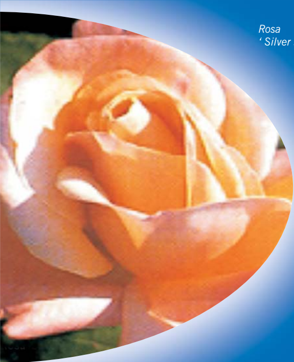
Rosa 'Silver Jubilee'