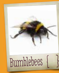
Bumblebees { }