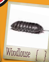
Woodlouse { }