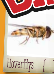
Hoverflies { }

...will eat aphids or other insect pests