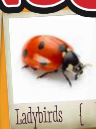
Ladybirds { }

...will eat aphids or other insect pests