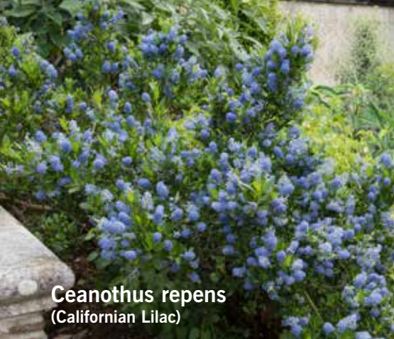
Ceanothus repens (California Lilac)