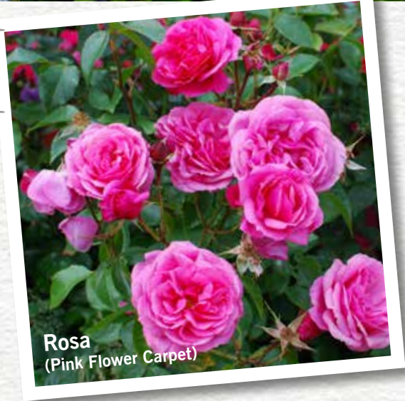
Rosa (Pink Flower Carpet)