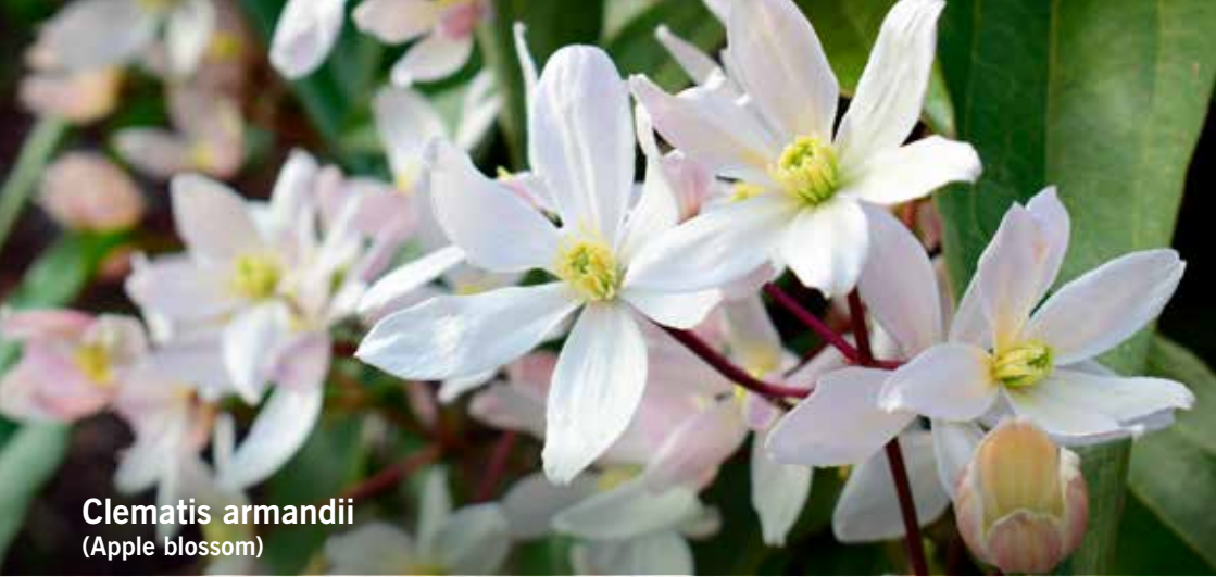
Clematis armandii (Apple blossom)