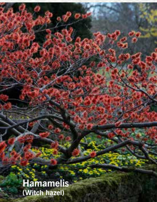
Hamamelis (Witch hazel)